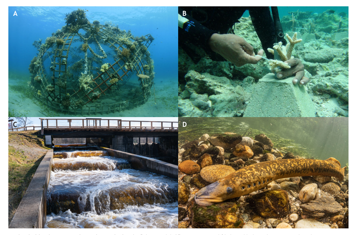
Fig. 3. Increasing habitat heterogeneity and complexity. As fishes exploit 3D structures and friction with the substrate to reduce locomotor costs, efforts could be directed toward restoring habitat complexity as a key strategy for species conservation. Here, we provide a few examples: (A) installation of artificial structures where reefs have been destroyed, (B) coral farming and out-planting in the wild, (C) creation of passageways for fishes where habitats have been fragmented by structures, and (D) increase in substratum complexity to allow fishes to save energy during upstream migrations.

Taxa such as salmonids, alosines and lampreys rely on various behavioral strategies to conserve energy during their migrations in freshwater, taking advantage of riverbed features, the natural